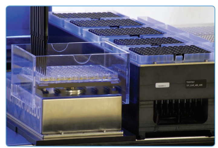
LVK - Microplate Adapter

A gravimetric balance-based hardware and software kit, the LVK enables you to quickly develop, optimize, and verify liquid handling on all Hamilton liquid handling platforms. For regulated laboratories, the LVK provides a turn-key solution for QC to verify pipetting of samples and reagents.