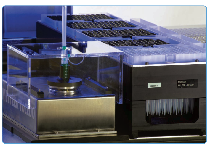
LVK — Tube Adapter

Create and test customized liquid classes that are optimized for your lab's environment, types of liquids, and volumes pipetted.