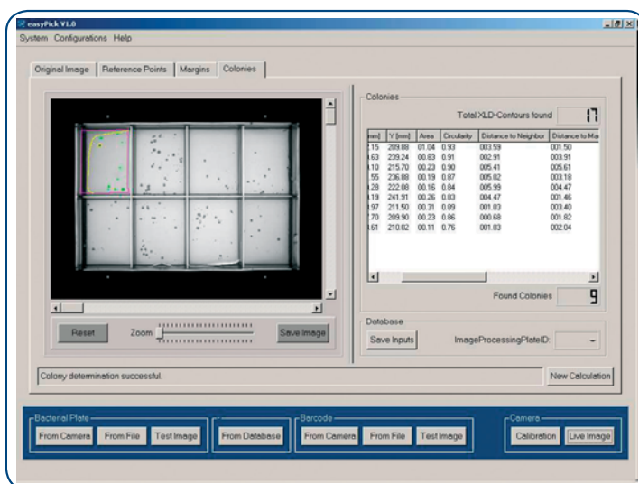
Figure 3: Colonies identified with easyPick. 17 contours were found. 9 have been identified as colonies according to the criteria defined by the user.

Based on location of the identified colonies, the software then calculates the robot-compatible coordinates.