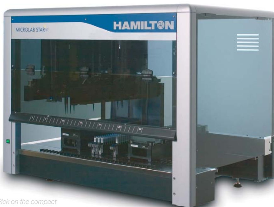
Figure 1: Colony picking with easyPick on the compact Microlab STARlet workstation

Compared to manual colony picking, the automated process is faster, more consistent and reliable. A number of manufacturers offer dedicated colony pickers which process thousands of colonies per hour. For many laboratories, this high throughput is in no relation to the throughput of upstream or downstream automation systems. Thus the costly colony picker spends a lot of unproductive waiting time. With easyPick Hamilton introduces a system which automates both, colony picking and sample preparation for related processes on a single, compact workstation (Figure 1).