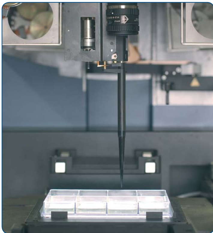
Figure 2: The camera is directly mounted on a channel of the Microlab STARlet. Colony picking is performed with the pipetting channels of the Microlab STARlet.

A high resolution camera is mounted on the pipetting arm of the instrument (Figure 2). It has its own drive allowing it to acquire images from any place on the deck of the instrument.